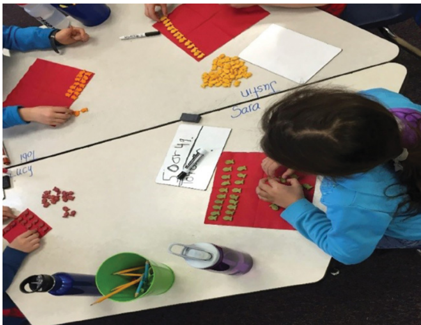
These second-grade students used an array to help them count.

could make when considering the problem. Students described several assumptions, such as, “It needs to be fair” and “We all should get the same.” As a class, we discussed the idea of fair sharing. One student explained fair sharing by stating, “If you and I share a candy bar, we should both get half. One of us shouldn’t get more.” The class agreed that all students should receive the same number of goldfish crackers.